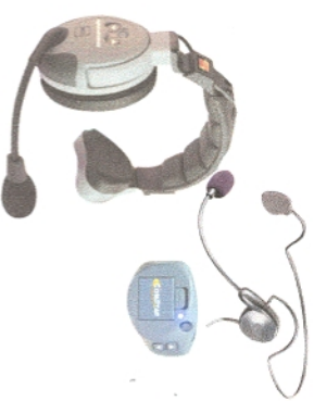
Duplex Wireless System