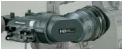
AJ-HVF21G 2" HD EVF 59.94Hz/50.00Hz switchable