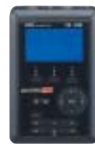
FireStore FS-100 Portable DTE Recorder (FOCUS Enhancements, Inc.)