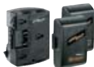
Anton/Bauer Battery Charger Package HTP-T230