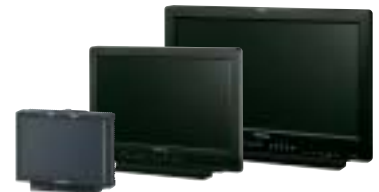
BT-LH900A 8.4" HD/SD LCD monitor BT-LH1700W 17" Wide HD/SD LCD monitor BT-LH2600W 26" Wide HD/SD LCD monitor