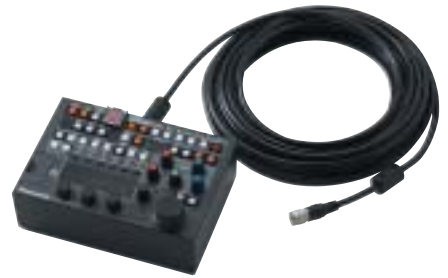
AJ-RC10G RCU (Remote Control Unit) • 10P Remote Cable 10m