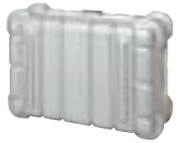
AJ-HT901G Hard Carrying Case *Not available in some areas.