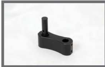
Low Mode "F" Bracket(Optional)