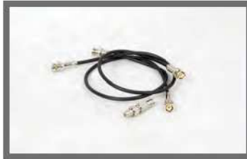
BNC video cables