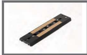
Long dovetail plate(Optional)