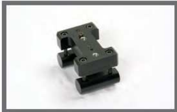
Low mode handle clamp