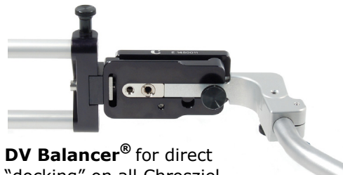
DV Balancer® for direct "docking" on all Chrosziel Light-weight supports of the 401- 4xx series or Camera Adaptor 3100.

The DV Balancer® comfortably places camcorders with built-in viewfinders in front of the eye leaving the hands free for camera control.