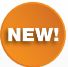
Tempest900 Available in U.S. and Canada