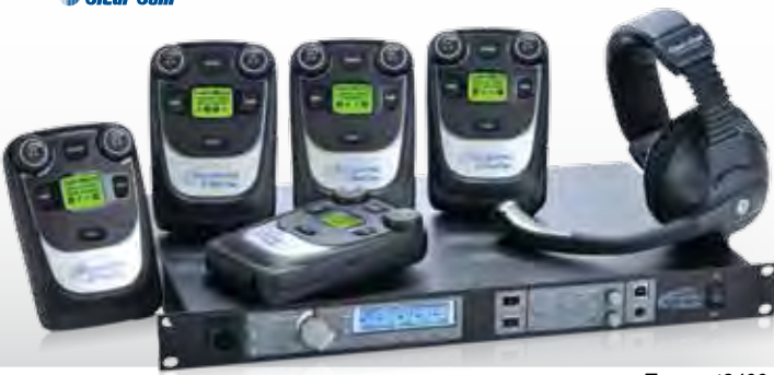
Tempest2400 Available Worldwide

Areas of the frequency spectrum that have traditionally been used for wireless intercoms are crowded and more difficult to use. Licensing requirements, radio spectrum reallocation and the wide variety of technologies compete for the same air space.