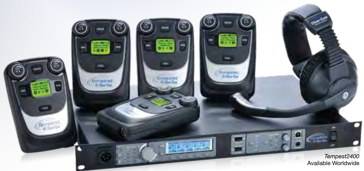
Tempest2400 Available Worldwide