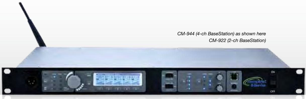
CM-944 (4-ch BaseStation) as shown here CM-922 (2-ch BaseStation)