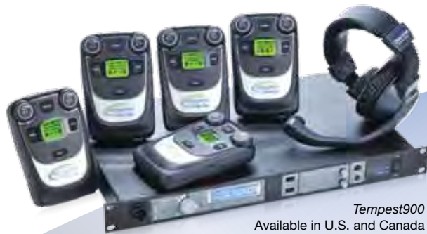
Tempest900 Available in U.S. and Canada