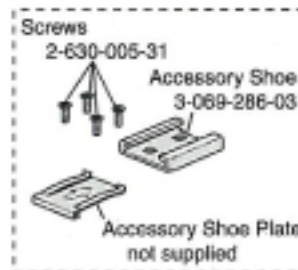
Accessory Shoe Kit X-2188-877-2