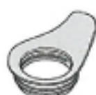
Large Eyecup X-2189-869-1