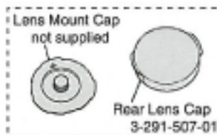
Lens Mount Cap Ass'y X-2188-940-1