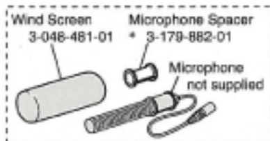
Wind Screen, Microphone ECM-XM1 1-542-749-11