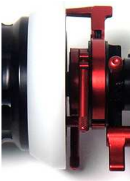
Image 2 : two hard stops on the left, the focus pointer in the middle and the friction lever on the right.