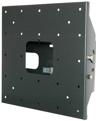
LANDSCAPE AND PORTRAIT PDW 32-70 P+L

Solid universal wall mount for all NEC Public Displays up to 70" for either landscape or portrait orientation.