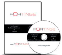
Teleprompter Software Mos Support