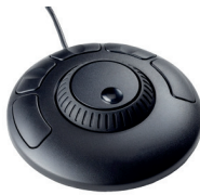
Hand Control Device