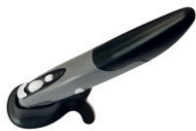
Handheld Pen Mouse