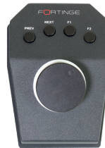
JC1 Hand Controller