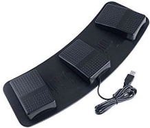
Foot Control Pedal