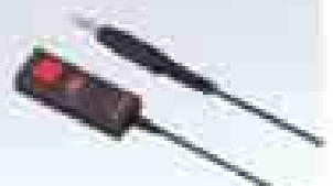
RM-81 Remote Controller