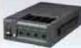
BC-410 Battery Charger for four BP-50As and four NP-1Bs