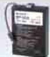
BP-50A NiCd Rechargeable Battery