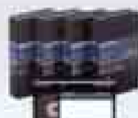
BCT-5MA/10MA/20MA/30MA Metal Particle Videocassette Tape (Small Cassette)