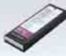
NP-1B NiCd Rechargeable Battery