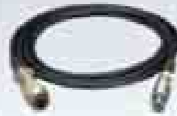
CCOX-3 Power Supply Cable for CMA-8A