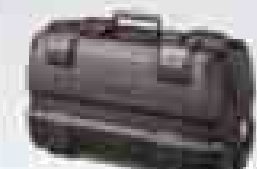
LC-421 Carrying Case for PW-637