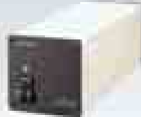
CMA-8A AC Adaptor (sold with the optional CCOX-3 cable)