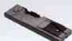
VCT-U14 Tripod Adaptor for DXC-637