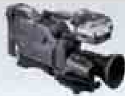
DXC-327A Door Video Camera Unit