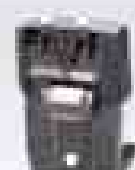
CA-514 Camera Adaptor for BVP Series Broadcast Cameras