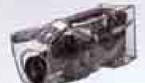
LCR-1 Rain Cover