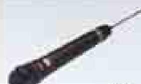
WRT-810A/830A Unit Wireless Microphone