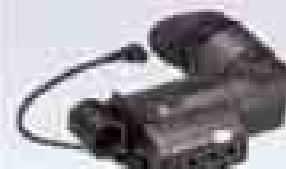
DXF-601 1.5 inch Monochrome Electronic Viewfinder