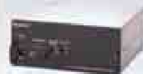
VA-300 Playback Adaptor