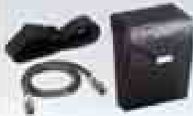
DC-210 Battery Case for BP-50A