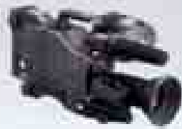
DXC-637 Color Video Camera Unit