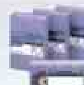
UVWT-10MA/20MA/30MA Metal Particle Videocassette Tape (Small Cassette)