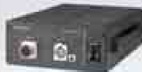
AC-550 AC Adaptor