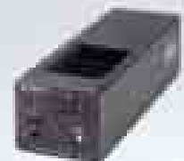
BC-1WD Battery Charger for four NP-1Bs