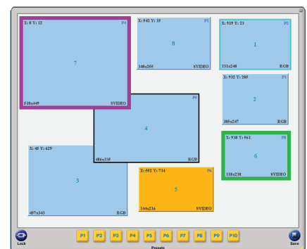
Remote operation via a web browser