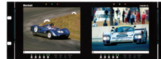
V-R82DP-2C Users Guide

1910 East Maple Ave. El Segundo, CA 90245 Tel.: 800-800-6608 • Fax: 310-333-0688 www.LCDRacks.com Email: sales@lcdracks.com