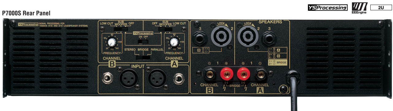
P7000S Rear Panel

Reliable, professional-quality power amplification for a broad range of applications.