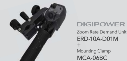
DIGIPOWER Zoom Rate Demand Unit ERD-10A-D01M + Mounting Clamp MCA-06BC