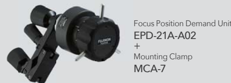
Focus Position Demand Unit EPD-21A-A02 + Mounting Clamp MCA-7