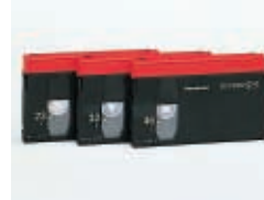
AJ-HP46LP/ HP32LP/HP23LP DVCPRO HD Cassette Tapes