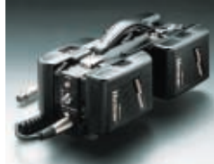
QBH Anton Bauer Battery Mount and 4battery Packs