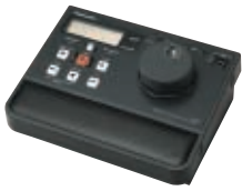
AJ-A95 9-pin remote controller