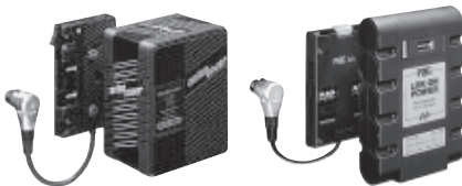
Anton Bauer and PaG battery adapters can be used.

In addition to operation with an AC outlet, the BT-S1050Y can be operated on a 12V DC supply. This allows it to be used as a field monitor for recording on location.