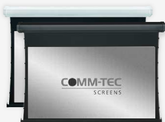
Housing available in black and white