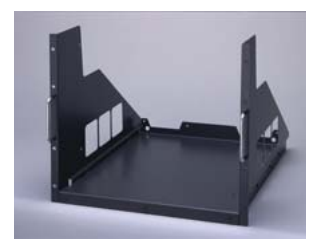
RK-C1900E EIA Rack Mount Adapter