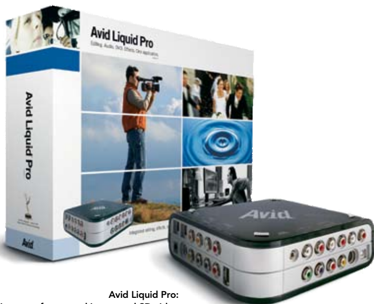
Avid Liquid Pro: All-in-one software and integrated SD video hardware for plug-and-play connectivity

Use Avid Liquid Chrome Xe to output your HD project—with real-time effects—on an external HD monitor or flat-screen display, to correctly judge color space and quality. Avid Liquid Chrome Xe can also perform a 10-bit down-conversion in real time, for SD versions with the highest possible quality.