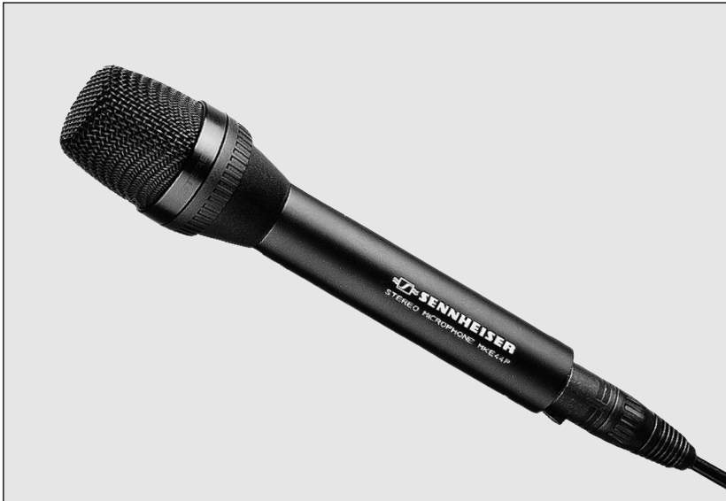
Cable pictured is an accessory not supplied with the microphone