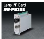
Lens I/F Card AW-PB308

Studio camera system card • Output: Y/C, VBS • 5-inch EVF (Zebra, safety zone, and center marker included), and intercom input and output, and tally output compatible