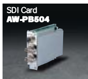
SDI Card AW-PB504

Connecting card for Contact-type pan-tilt head • When WV-CB550 is used, panning, tilting, zooming, and focusing are possible. With a fixed-type camera, zooming and focusing are possible.