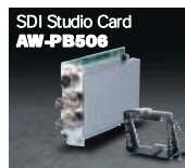
SDI Studio Card AW-PB508

Digital connecting card for video equipment with SDI input jack • Output: Serial digital interface (SMPTE259M [4:2:2 SDI]) • Zoom/focus of MD lens can be controlled by the controller WV-CB550.