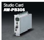
Studio Card AW-PB305

Studio camera system card • Output: Y/C, VBS • 5-inch EVF (Zebra, safety zone, and center marker included), and intercom input and output, and tally output compatible