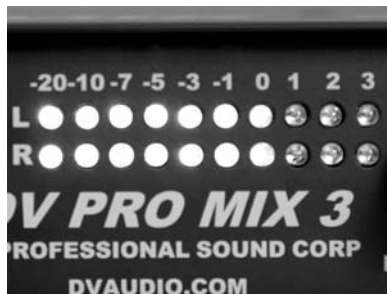
Meters Showing 0dB Signal Level