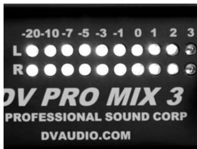
Meters Showing +2dB Signal Level