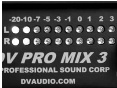
Meters Showing -10dB Signal Level