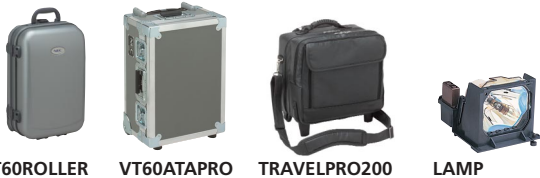
VT60ROLLER VT60ATAPRO TRAVELPRO200 LAMP